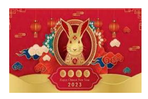
Table of the Week

There will be a Head teacher competition every half term.